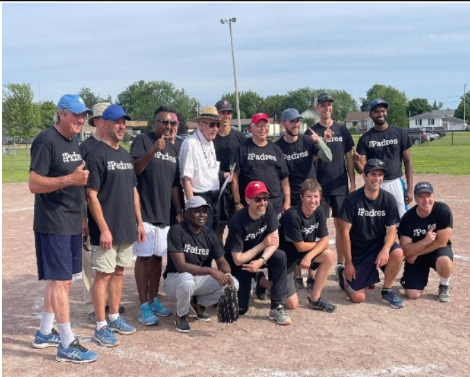
"The Padres" played a Fund Raiser Lob Ball game in Landsdowne. Fun was had by all, the weather and company was great!

We pray for small and medium sized businesses; in the midst of economic and social crisis, may they find ways to continue operating, and serving their communities.